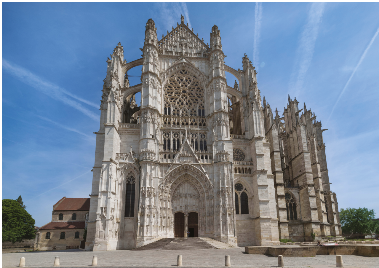
Figure 3: Beauvais Cathedral , 1225 onwards, stone and glass, (Beauvais, France)