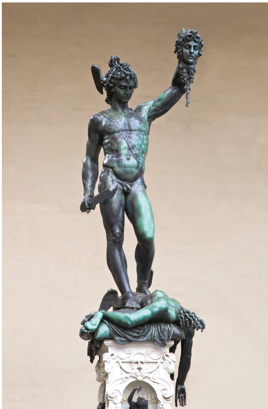
Figure 2: Benvenuto Cellini, Perseus , 1545–54, bronze, height of figure 320 cm (Loggia dei Lanzi, Florence)